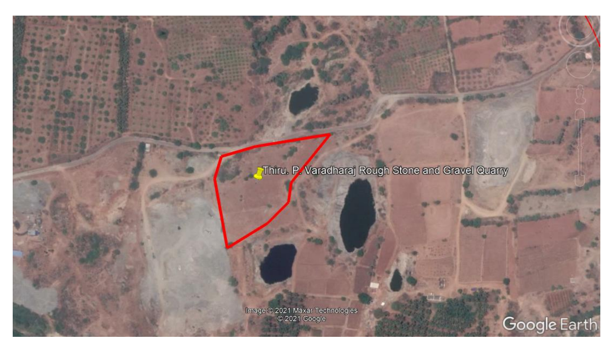
Figure 2: Google Image of the Project Site