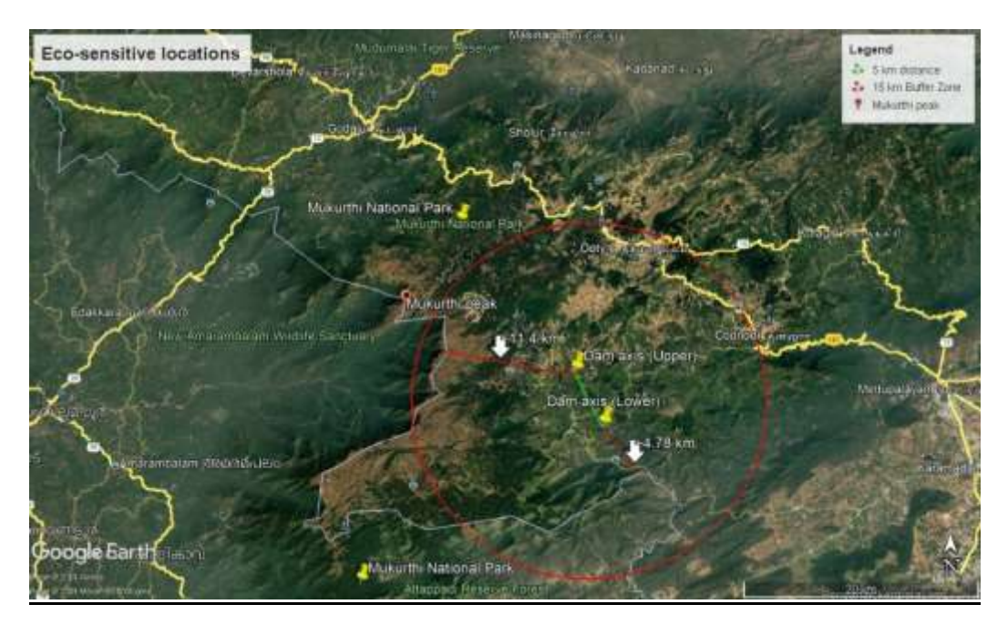
Figure 3 Location of Upper and Lower Reservoirs w.r.t Mukurthi National Park

Montane Wet Temperate Forest (shola) as classified by Champion and Seth (1968), Grassland and Plantation. The proposal for declaration of ESZ around Mukurthi National Park was taken up for consideration by the State Government representative. The Upper Dam site and Lower Dam Site are located about 11.4 and 4.78 km respectively from the boundary Mukurthi National Park (refer Figure-3.)