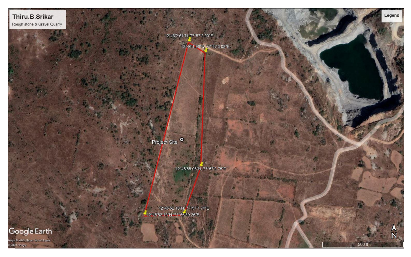
Figure 2: Google Image of the Project Site