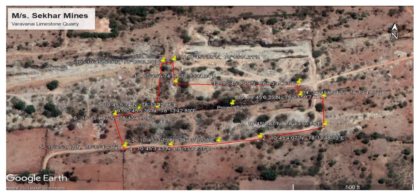
Figure 2: Google Image of the Project Site