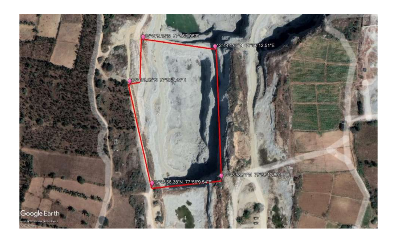
Figure 2: Google Image of the Project Site