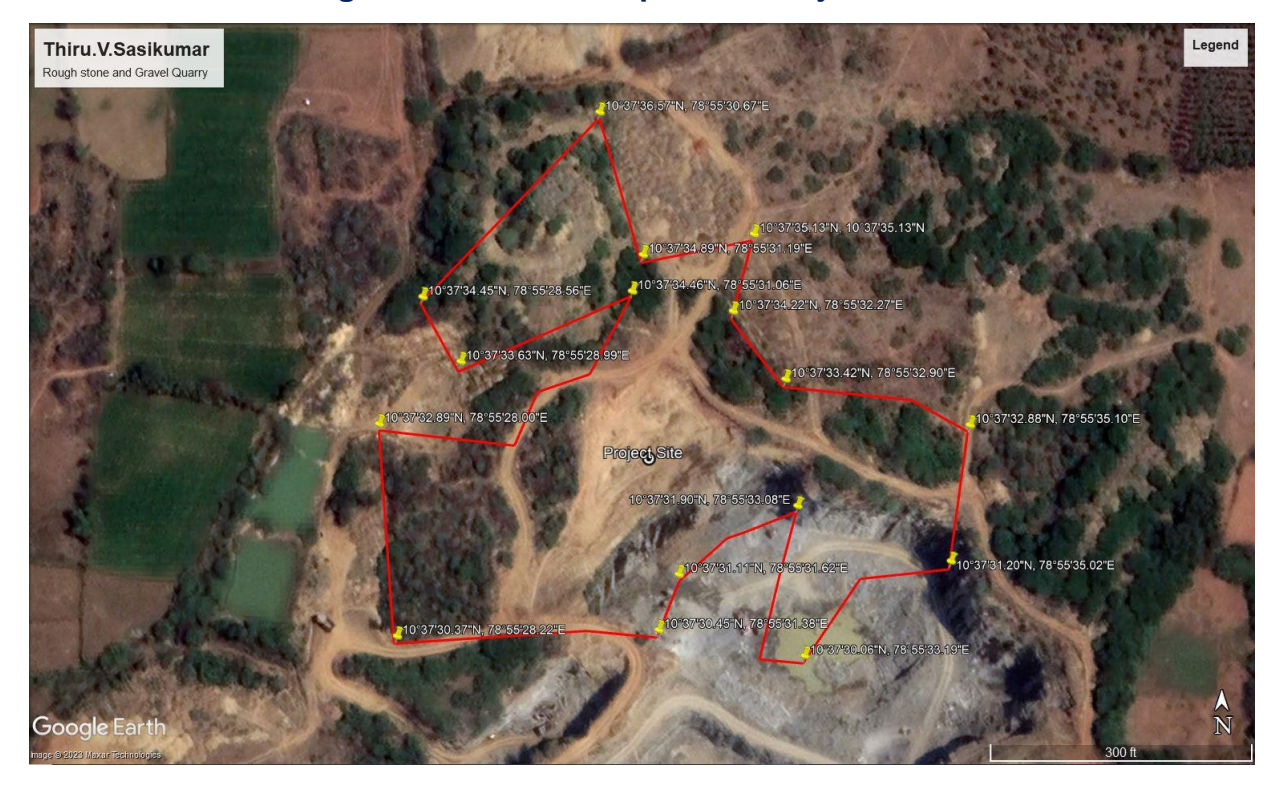
Figure 2: Google Image of the Project Site