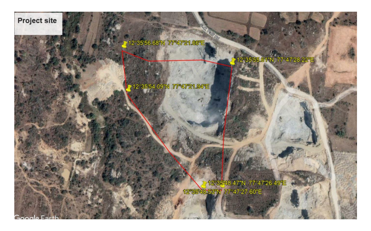
Figure 2: Google Image of the Project Site