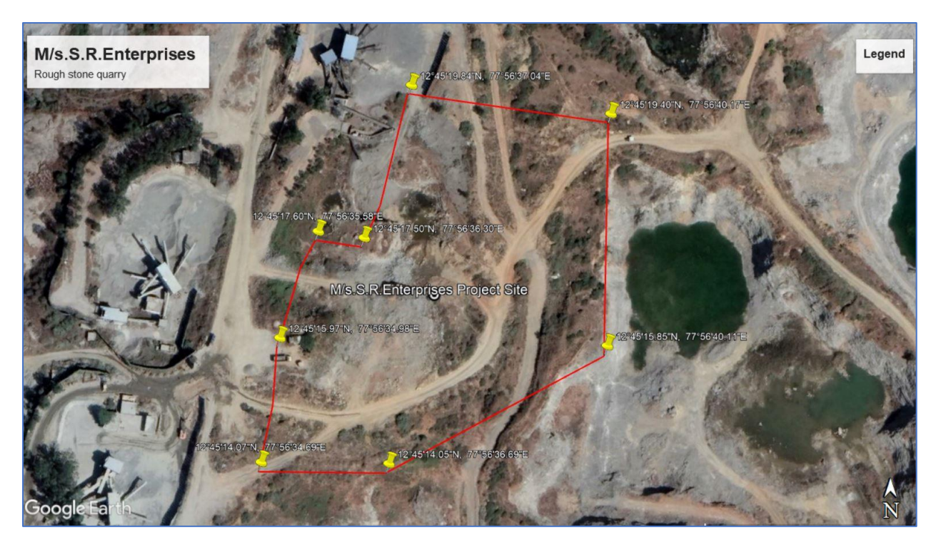
Figure 2: Google Image of the Project Site