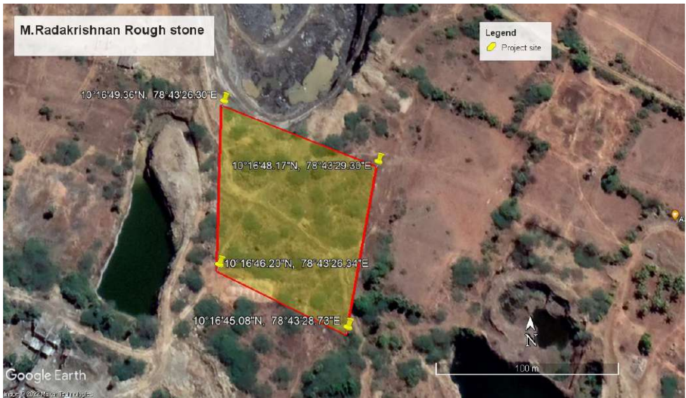
Figure 2: Google Image of the Project Site