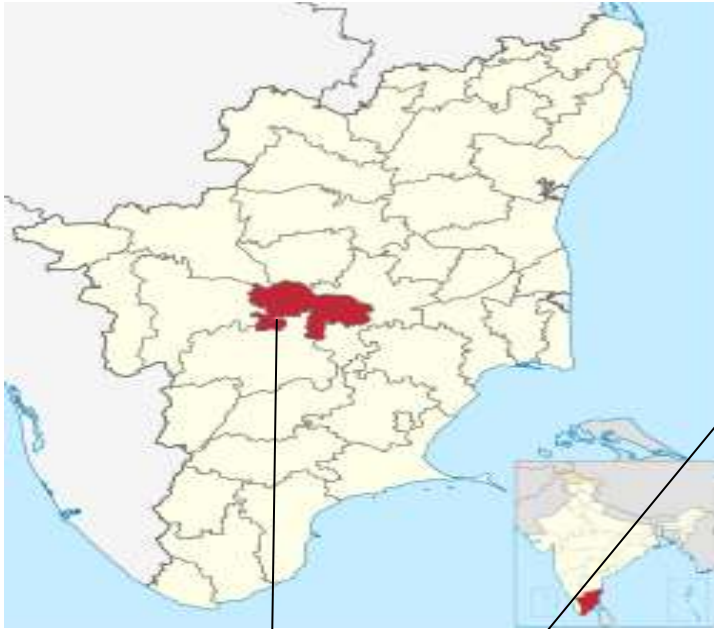
Figure 1: Location Map of the Project Site