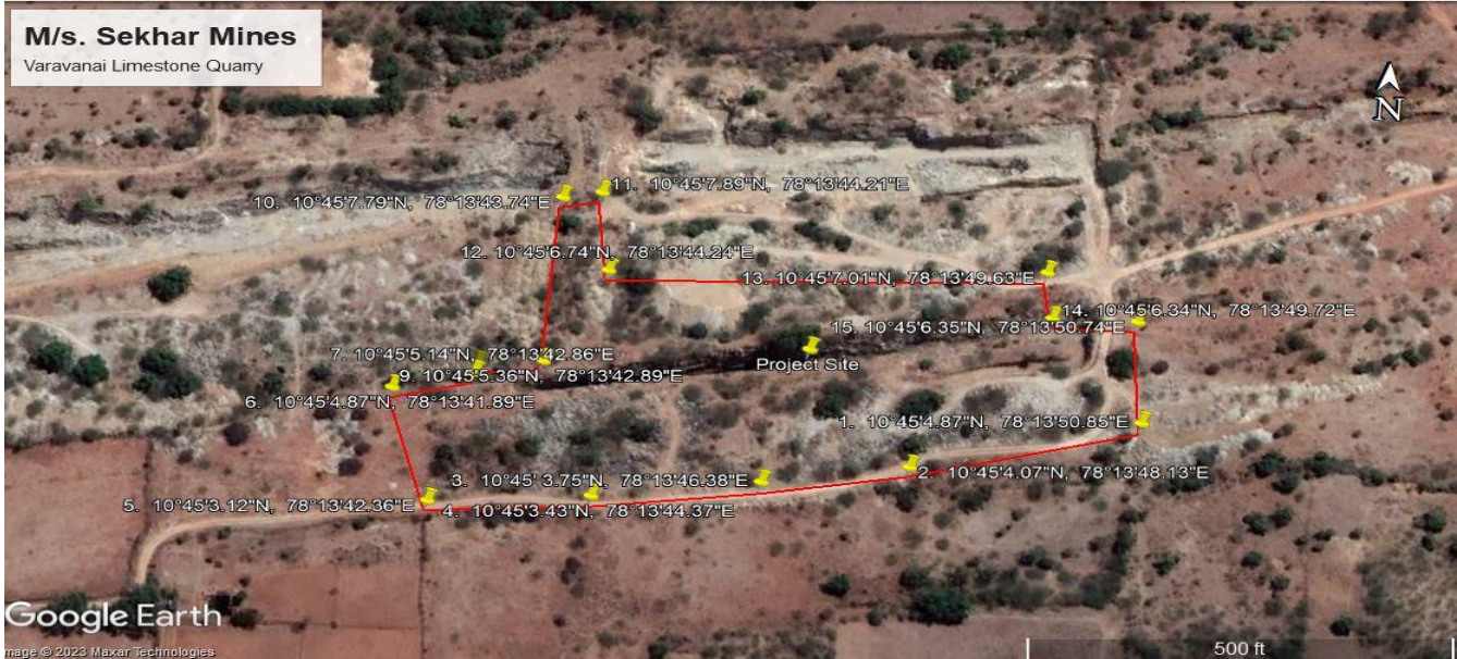
Figure 2: Google Image of the Project Site