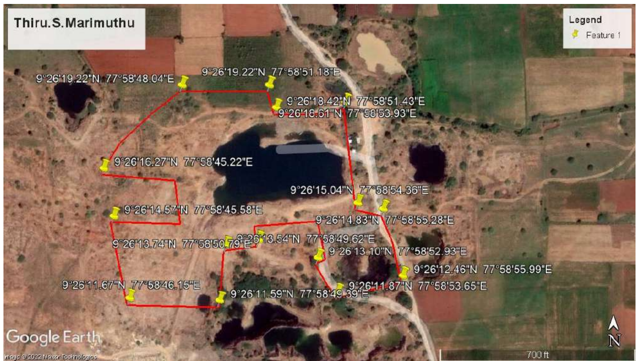
Figure 2: Google Image of the Project Site