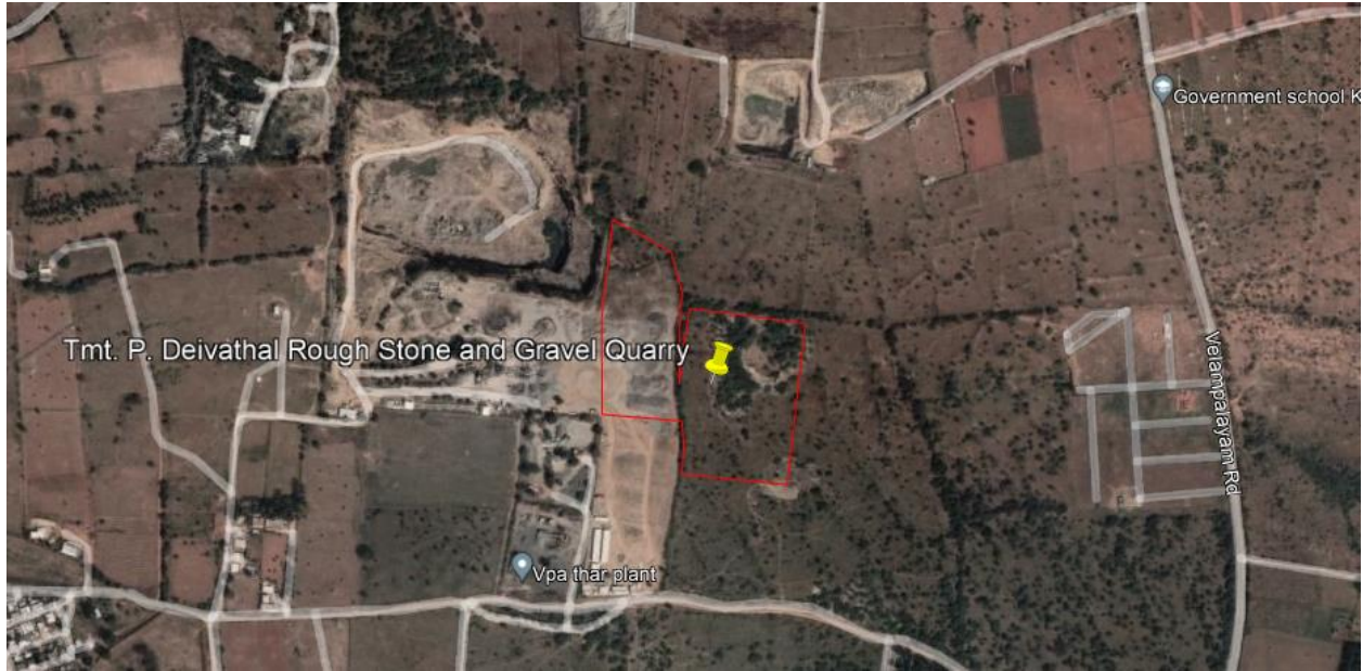
Figure 2: Google Image of the Project Site